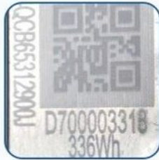
Complete QR Code