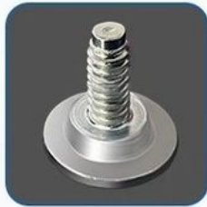
Positive/ Negative Electrode