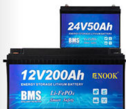
12V & 24V SERIES ENERGY STORAGE LITHIUM BATTERY