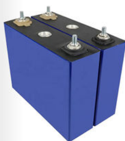
Lifepo4 battery 3.2V 304A