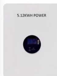
Solar LiFePO4 B5.12KW 51.2V 100Ah 200Ah atttery