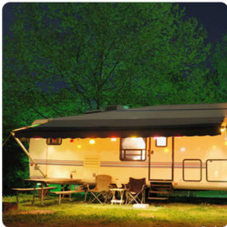
RV Energy Storage