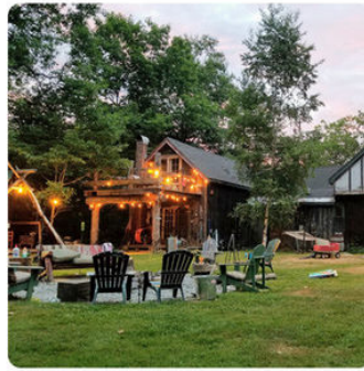
Home Back Up Electricity