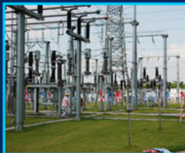
Power Station energy storage