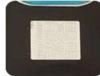
Complete QR Code