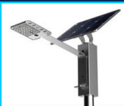
Solar Street Lighth