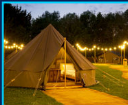
Household energy storage