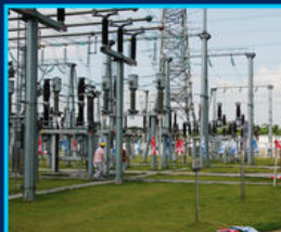
Power Station energy storage