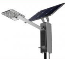
Solar Street Light