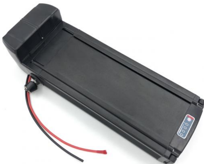
60V 15AH Battery Pack

We have been in lithium battery pack for more than 8 years and know how to provide you the right solution for you. Just let us know your detail application and request then we will choose the best solution for you.